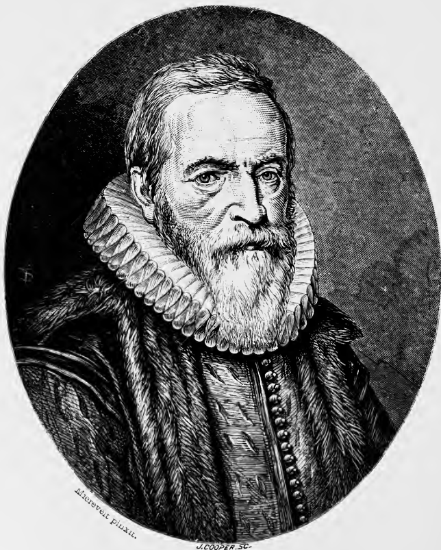
JOHAN VAN OLDEN-BARNEVELD.